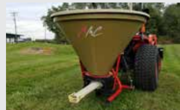
Spout arc adjustment

250# per acre is the desired rate of application. Rows are on 24' centers. Band width requires a pass down every row