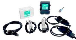
ORD-KP DPAE ISOBUS W/weighting system