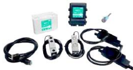
ORD-KP DPAA ISOBUS W/weighting system