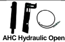
AHC Hydraulic Open