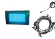
Cable monitor, GPS antenna