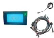
Cable monitor, GPS antenna