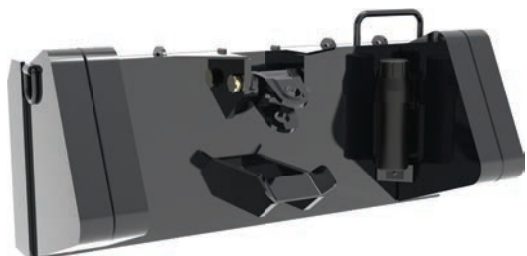
Ballasted to add 1400 lbs to increase drilling down pressure.