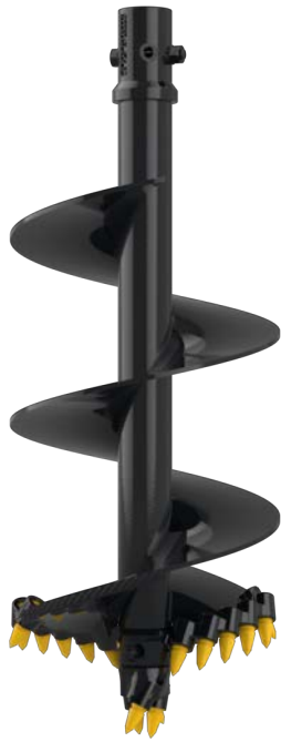
Single Flight Auger

The Bullet Series features C1HD Plus Bullet Teeth along with convenient wear indicator strips on the boring head, and is built with reinforced 3/4-inch flighting for extended service life.