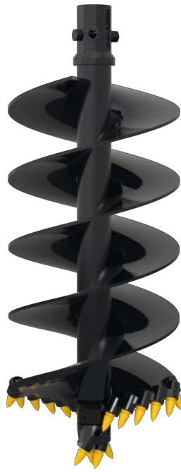
Double Flight Auger

Double flighting at the head with single flighting along the shaft.