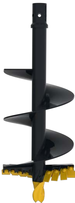
Single Flight Auger

The contoured cast head reduces hang-ups while drilling, letting you focus on the job, not the soil.