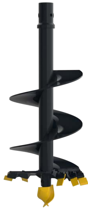
Single Flight Auger

Featuring a boring head with compound angles and robust 4.5-inch pilot engineered for lasting strength and smooth drilling operation.