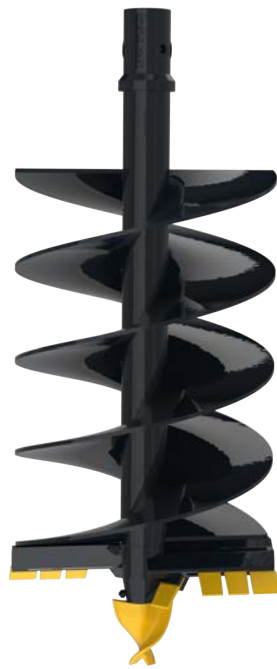
Double Flight Auger

Double flighting at the head with single flighting along the shaft.