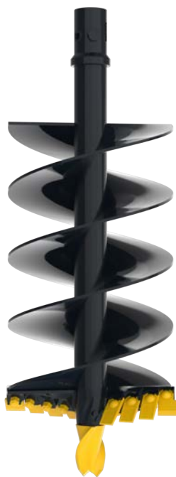
Double Flight Auger

Double flighting at the head with single flighting along the shaft.