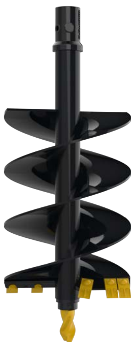
Double Flight Auger

Double flighting at the head with single flighting along the shaft.