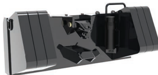
Ballasted to add 1900 lbs to increase drilling down pressure.