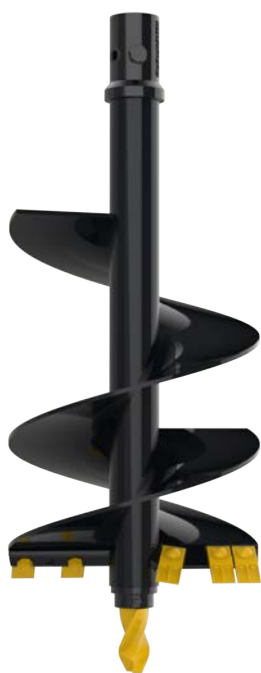
Semi-Double Flight Auger

Designed for durability, each DCA auger features a hardened cast boring head built to handle the rigors of repeated use without compromising performance.