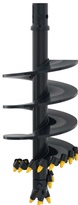
Single Flight Auger Single flighting at the head with single flighting along the shaft.

With a conical cutting profile and aggressive layout of C1HD carbide teeth, this auger series boasts productivity where others stall.