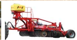
Seeder platform available for mounted/semi-mounted cultivator.