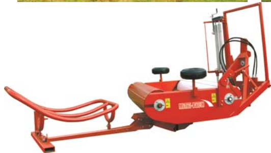
Shown with optional off load ramp with end tip