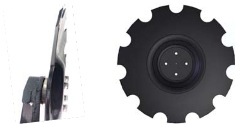
¼" thick x 22" diameter