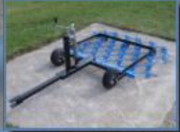
Wheeled Carrier (No Hydraulics Required)