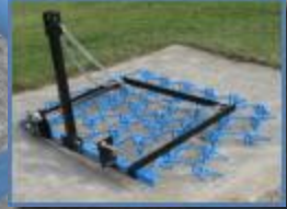
3point Hitch Lift Frame (Category One)