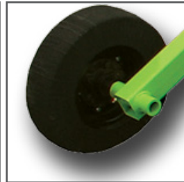
Optional laminated tires