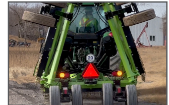
Narrow 98" transport width and over-centering wing design