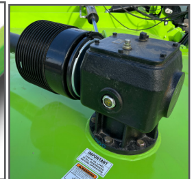
225 hp (168kw)* center and wing gearbox with sight glass