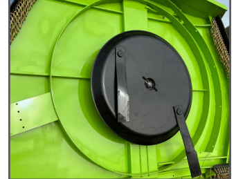
Heavy duty spun pan unit with 4" blades and pentagon blade bolts