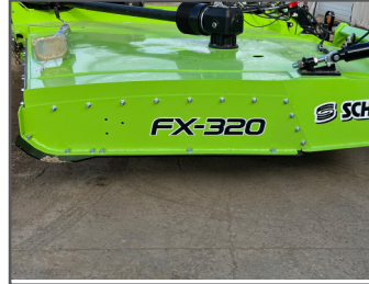
Removable/replaceable side skirts