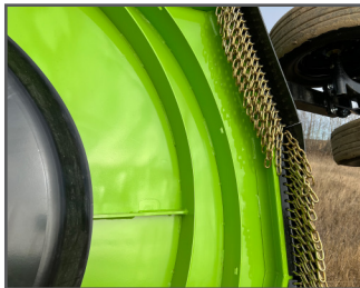
Deck protection rings are standard