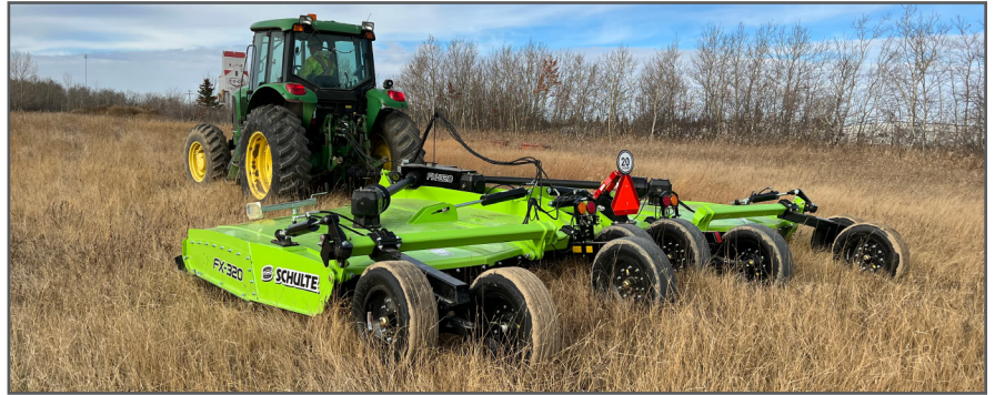
Available with walking axles as shown or straight through axles