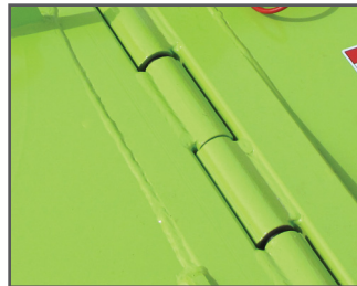
Heavy duty cast hinge line with wiper seals