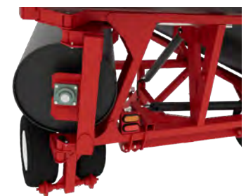
3" DRUM SHAFT & BEARING