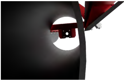
1/2 INCH THICK DRUM