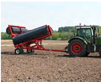
FORWARD FOLD DESIGN