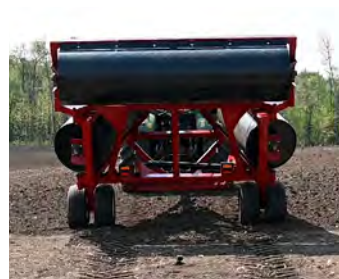
NARROW TRANSPORT WIDTH