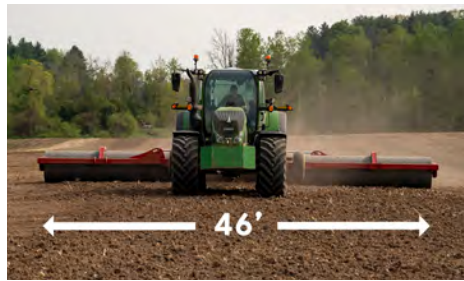
34' - 46' WIDTHS