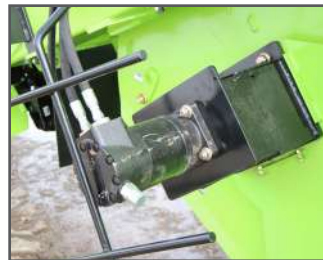
All hydraulic motors have a built in cushion valves for longer life