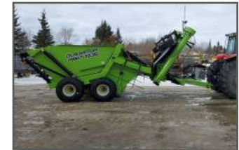
Transport width is only 118" (under three metres)