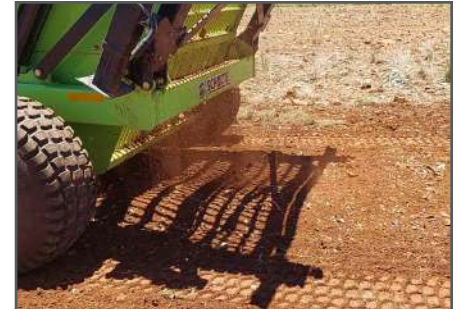
The area behind the rock picker is left clean, with stones sized from 2"-27" (5cm - 69cm) removed