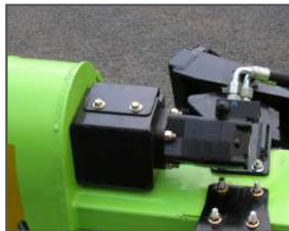
The dual windrowers have hydraulic motors with chain drive