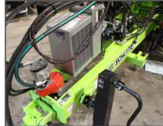
Windrower hydraulic pump and cooling system ties into tractor PTO