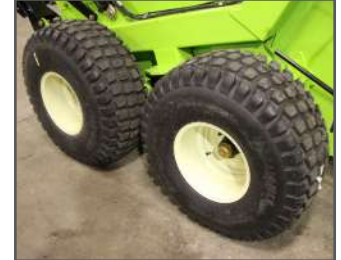
Tandem walking axles with 16.5L X 16.1 X 10 ply flotation tires