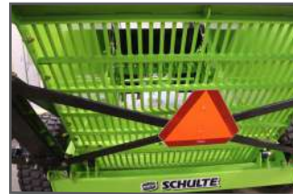
Rear and bottom grates ensure soil is easily sifted through the hopper