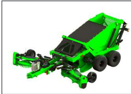
Weight: 15015lbs (6825kgs) Height: 122" (3100mm) Length 310" (7890mm)

-PTO Driven Windrower Drive Hydraulics 540-1-3/8" 6 Spline, 1000-1-3/8" 21 Spline, 1000-1-3/4" 20 Spline