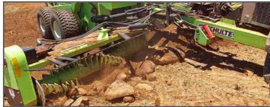
Rocks are easily removed by the two side windrowers with a variable working width of up to 19' (5.8m)