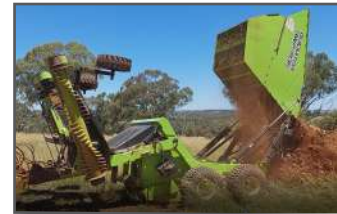
Dumping height 8' 7" (2616mm) allows for larger piles when dumping