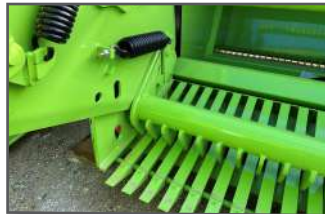
Heavy duty batt springs, 450 BNH steel reel and grate with replaceable teeth