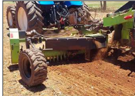
Windrowers with durable castor tires ensure rocks are easily moved away leaving a clean surface