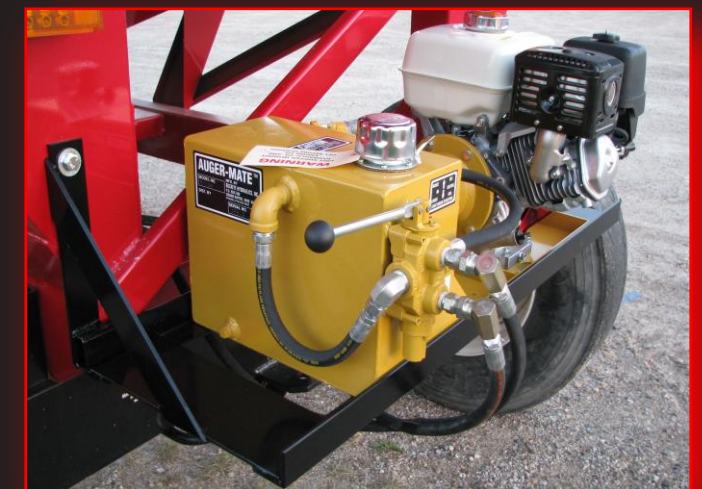
"AUGER-MATE" HYDRAULIC POWER UNIT

Sch. 40 PVC tube, 6 cu. inch motor c/w manifold mount control valve, 1000 lb. brake winch, 4' wire reinforced downspout, ½" x 22' hydraulic hoses, adjustable transport bracket, EZ-Swing cable system & choices of plastic, cupped plastic, bristle & cupped steel flighting.