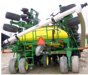
14' Single Auger for John Deere 1690, 1890 & 1990