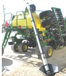
18' Single Auger for John Deere N530C Air Drill