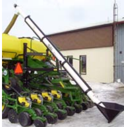
18' Single Auger for John Deere 1790