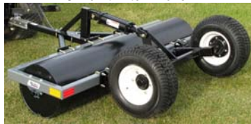
Hydraulic Lift Roller