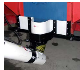
Straight Side Kit