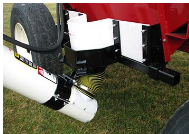
Ultra Glide Hopper

Options include: 3 stage telescopic downspouts, 60" hopper for larger door openings, electric on/off control kits, hydraulic power units and mounting kits for straight door sided gravity boxes.