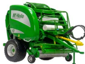
V6 Baler Model

100-120 LEHIGH AVE. P.O. BOX 928 BATAVIA, NY 14021 PHONE: 800-252-1552 FAX: 888-852-7406