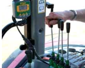
4 lever cable controls from the tractor seat