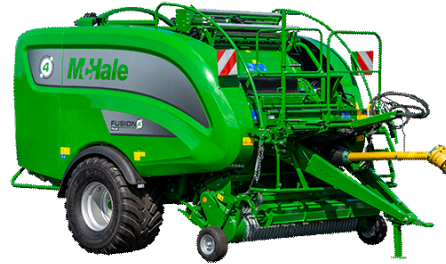
Fusion 4 Plus