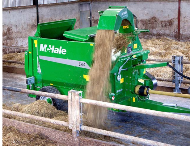
C460 Processor - Trailed

It's an ideal machine for farmers who wish use it for bedding stalls and feeding out bales.