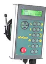
Electric Controls on 991BE