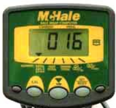
Programmable Bale Counter