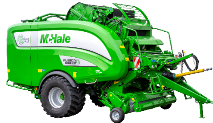
Fusion 4 Vario Plus

100-120 LEHIGH AVE. P.O. BOX 928 BATAVIA, NY 14021 PHONE: 800-252-1552 FAX: 888-852-7406