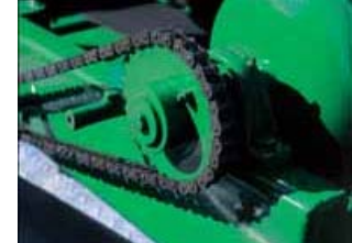
Shear bolt protection