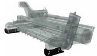
Floating Spill Shield Kit