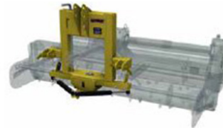
CAT I Swivel Hitch