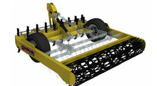
Hydraulic Lift Axle