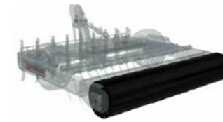
Smooth Roll Water Tank