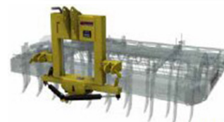
CAT I Swivel Hitch