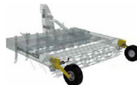
Rear Wheel Kit