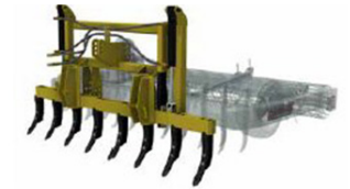
Smooth Roll Water Tank