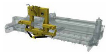
CAT II Swivel Hitch