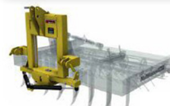
Swivel Hitch CAT I