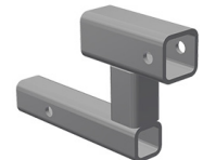
Optional Drag Mat Hitch Extension

REIST INDUSTRIES 100 Union Street Elmira, Ontario, Canada