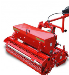
Grass Seeder: for grass and grass like seed. Option for all Rotex and Yellowstone models