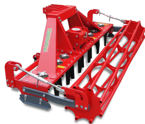
Cage Roller: option for all Rotex models