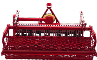
Screen Roller: option for all Rotex models