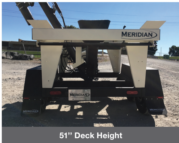
51" Deck Height

Dependable and perfect for filling separate boxes or bulk fill planter. Auger features a 14' delivery height and 17' delivery reach with spout extended.