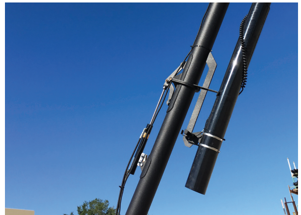
6" Poly-Cupped Auger with 3- Tier Spout

The 2XT hydraulic drive creates a smooth operation for all functions.