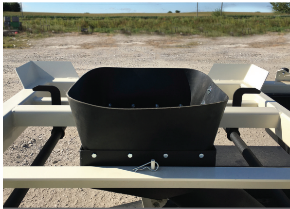
Patented Box Guides

The patented Meridian Box Guides simplify loading seed boxes onto the tender.