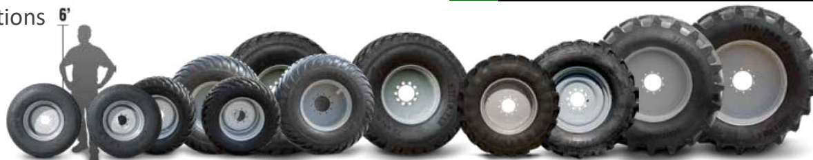
425 x 22.5 (16 x 22.5) 550/45 - 22.5 700/50 - 26.5 750/60 - 30.5 480/70 R30 600/65 R34 710/70-38 710/70-42