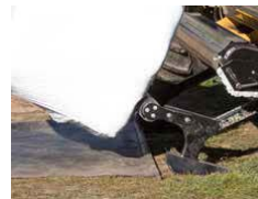
Bale Bumper: Ensures the bale lands far enough away from the table to rotate.