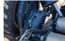
Power Drive (optional)