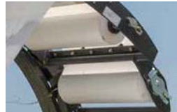
Offset Twin Wrap (optional)