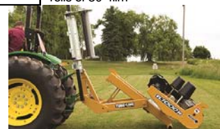
3 Point Hitch Lift: Easily unloads wrapped bales.