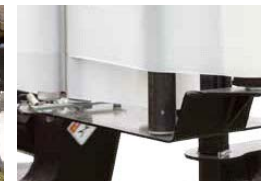
Twin Wrap: Offset with 4" Lead