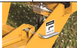
Manual Transport Lock: Secures bale platform to prevent dumping during transport.