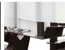
Twin Wrap (Offset) Uses 2 rolls of 30" film