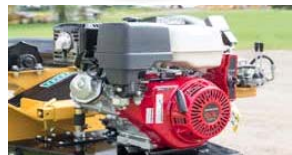
Optional Power Pack