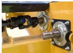
Drive Selection: allows the wrapper to switch between round and square bales