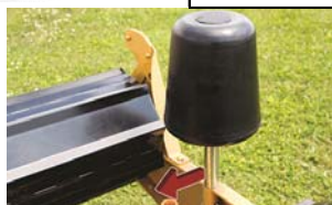
Adjustable Bale Guides: Allows 4' or 5' bales to be centered on the turntable.