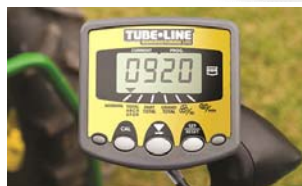
Wrap Counter: Sets desired number of rotations of wrap per bale/displays current rotation.