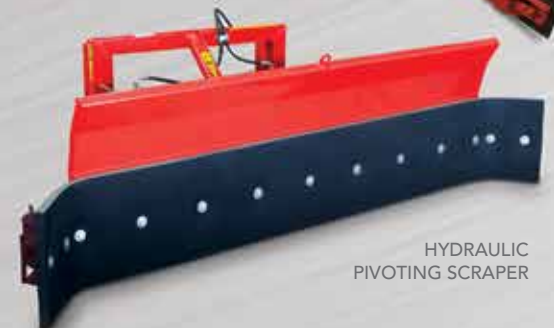
HYDRAULIC PIVOTING SCRAPER