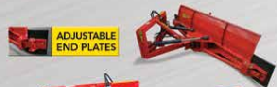
ADJUSTABLE END PLATES